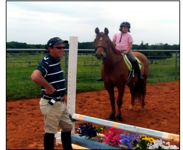
USHJA Emerging Athletes Program identifies promising young talent and assists them with world class coaching and training.

UPDATE: The Texas Dressage Classic ( Sept. 24-27) tells us that they are adding daily to their list of live and silent auction items. For example - they have guitars signed by Randy Travis and Miranda Lambert and a gorgeous miniature horse from Texas Angels. Tables for